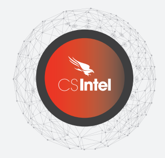
Hexadite AIRS combines its own artificial intelligence with the real-time threat intel on the top threat actors, attack vectors and trends from Falcon Intelligence to determine whether an alert is benign or an attack.

Alerts from CrowdStrike automatically trigger Hexadite Automated Incident Response Solution (AIRS) to launch a full investigation.